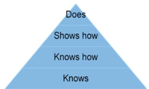
Figure 1 - Four Levels of Attainment for Competencies

Each case in the OSCE station consists of 10 to 15 checklist items that reflect the necessary competencies. The computer-based test assesses the "knows" and "knows how" levels, while the OSCE evaluates advanced problem-solving skills. The "does" level is measured through professional practice and ongoing competency activities.